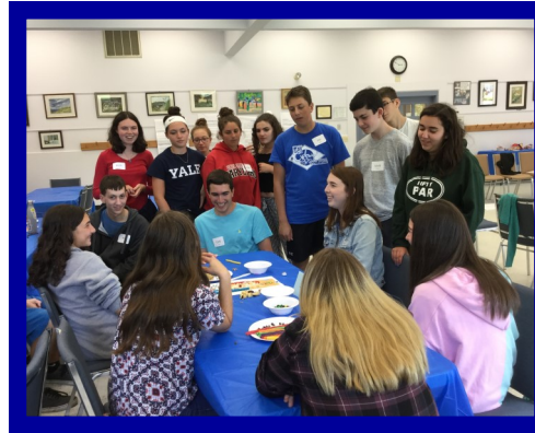
Gesher LeKeshet Leadership Retreat

Talmidim are students entering 7 th , 8 th and 9 th grades in September 2018 (Learners)