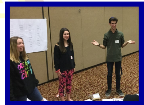
Gesher LeKeshet Outreach

Jewish Family & Children’s Service 707 Alexander Road, Suite 102 Princeton, NJ 08540 609-987-8100 x210