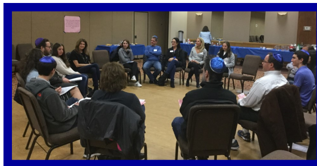
Gesher LeKeshet Family Night